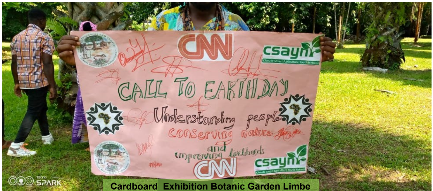
Cardboard Exhibition Botanic Garden Limbe