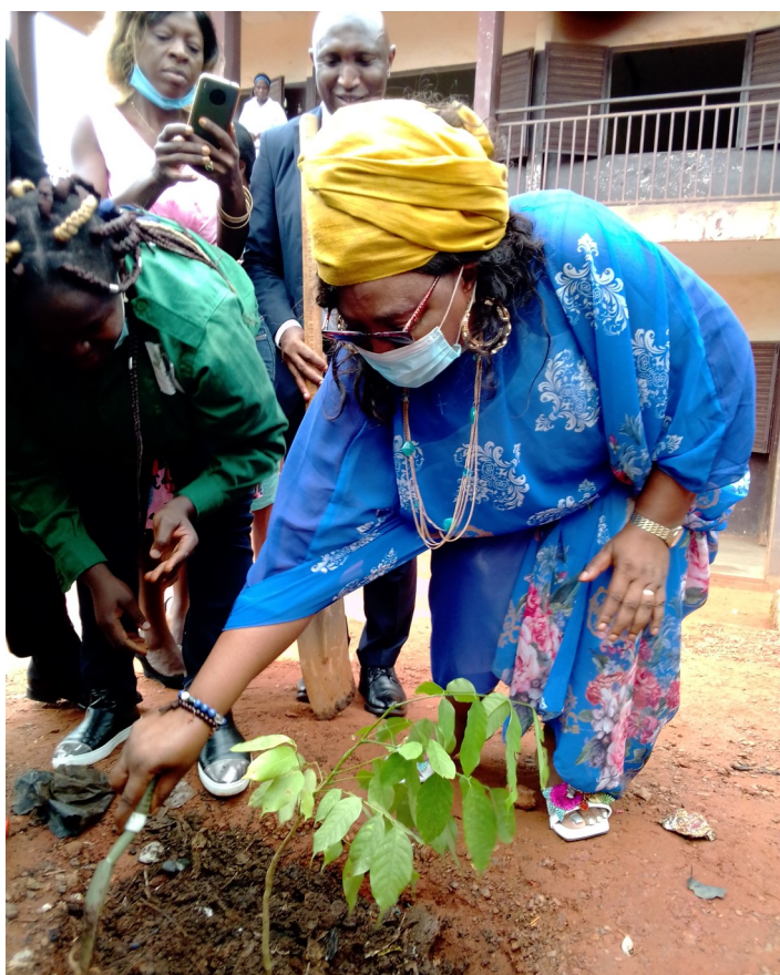
Subdivisional Inspector for Basic Education Yaounde VI, planting a tree to launch tree planting exercise

Subdivisional Inspector for Basic Education Yaounde VI