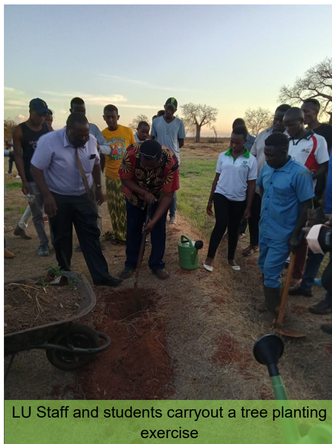
LU Staff and students carryout a tree planting exercise

cise and watering couple with some minor activities such as poetry, drawing, shari, vlogs, songs, talks on biodiversity, a water purification exhibition, keynote addresses and interviews.