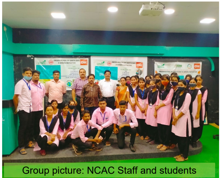
Group picture: NCAC Staff and students