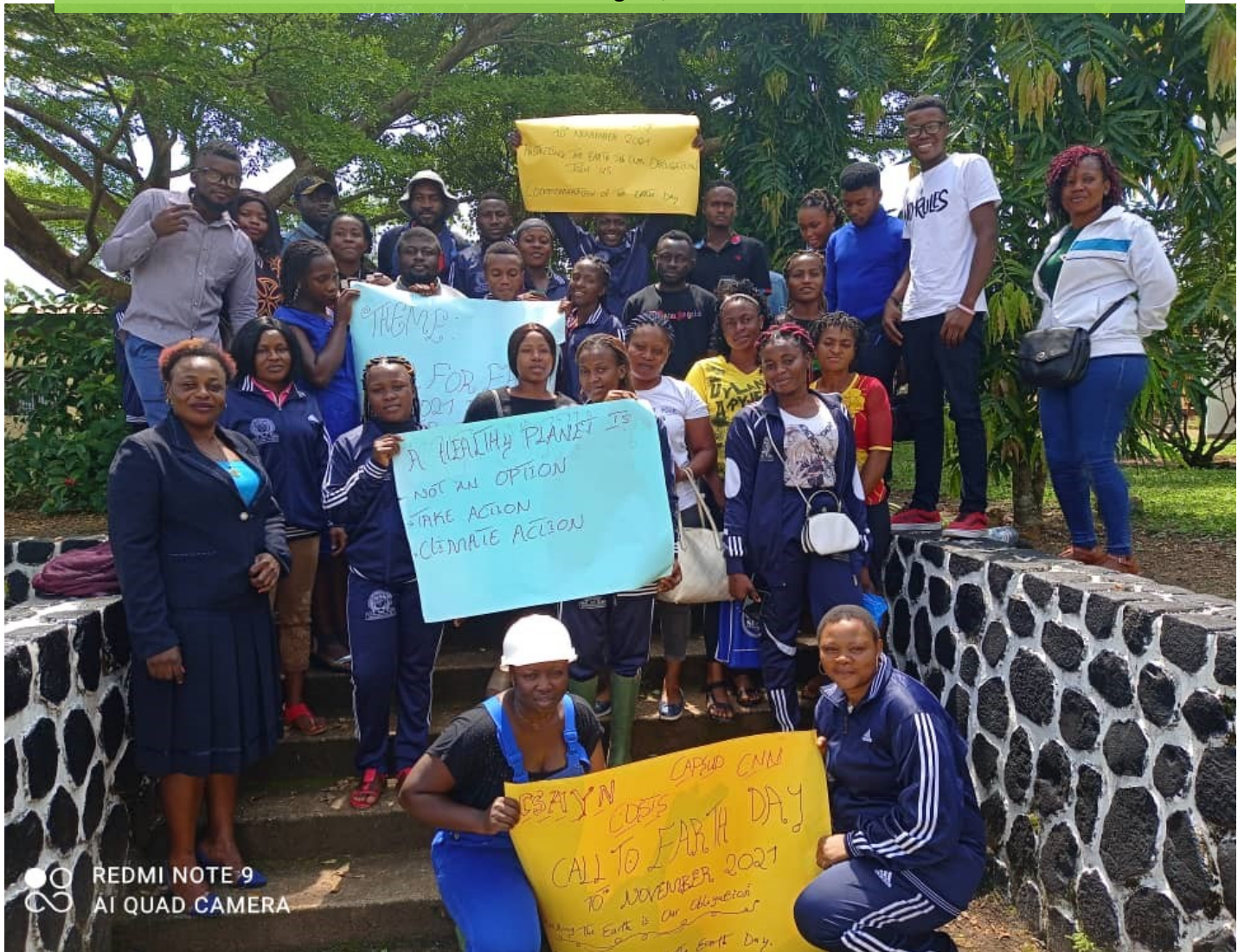
Family picture: The Call To Earth Day Launch at the Community Development Specialization Training School (CDSTS) hosting the Women in Agriculture for Sustainable Africa (WASA) program, Kumba, South West Region, Cameroon