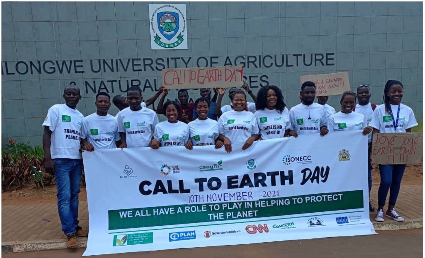
University students from different institutions in Malawi have started week long #CalltoEarth activities.