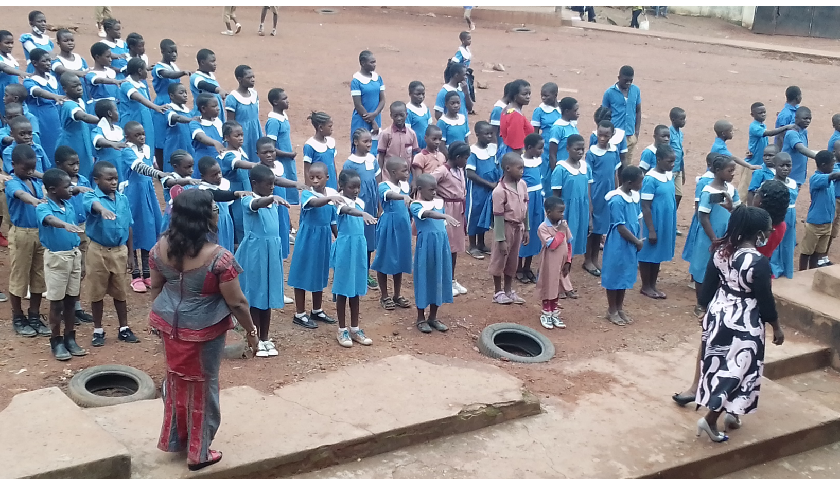
Pupils of GBPS SIC Biyem-Assi, Yaounde Cameroon with teachers at the grand stand in preparation for the #CallToEarth Day Launch Ceremony

November 10, 2021, was the day set for the #CallToEarth Day.