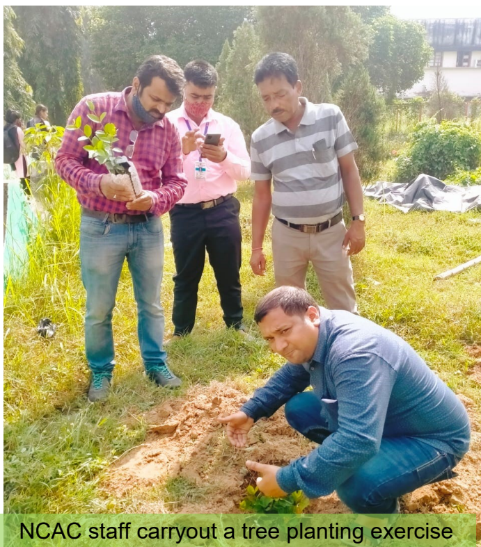
NCAC staff carryout a tree planting exercise