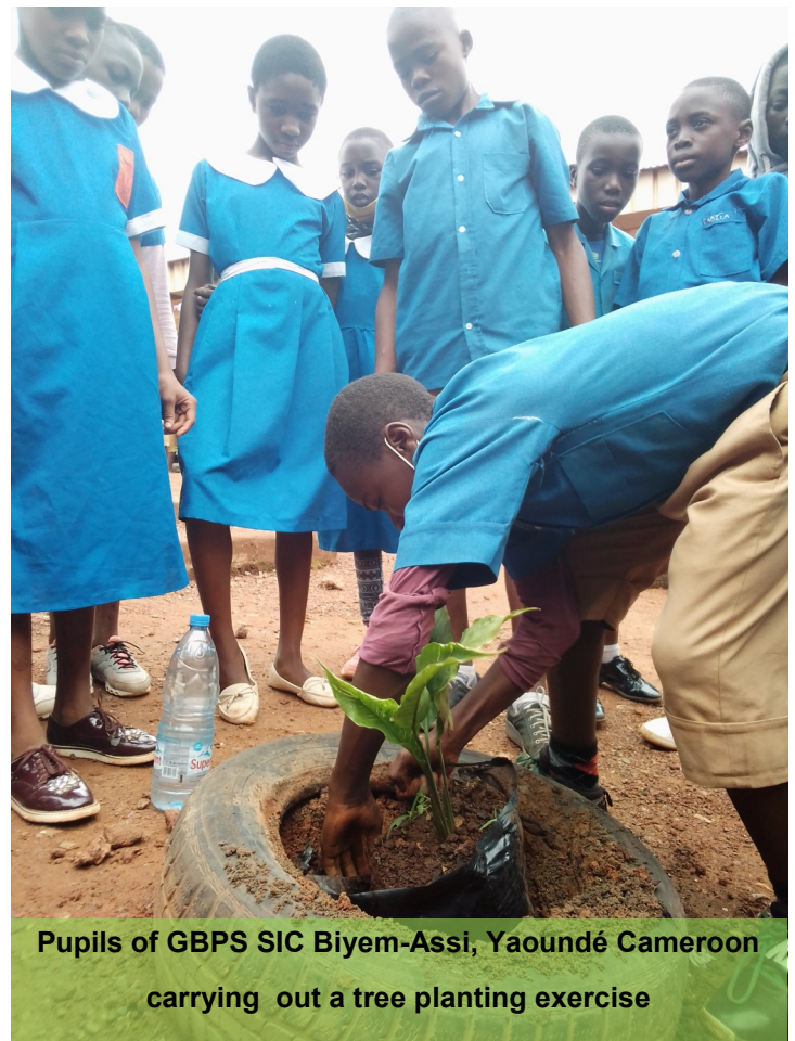
Pupils of GBPS SIC Biyem-Assi, Yaoundé Cameroon carrying out a tree planting exercise

In line with the CNN global call, Climate Smart Agriculture Youth Network Global (GCSAYN), L'Agence Nationale d'Appui au Développement Forestier (ANAFOR) Cameroon and, supporters launched the “ Green School Initiative ” as part of the strategic plan for the Children and Youth in Agriculture Program (CYA). The “Green School Initiative” aims in promoting environmental education, restoration and conservation practices in schools through tree planting and growing. Over 429 persons attended the event including pupils, teachers and observant. 300 nursery trees were donated by ANAFOR-Cameroon as part of their support for this Initiative.