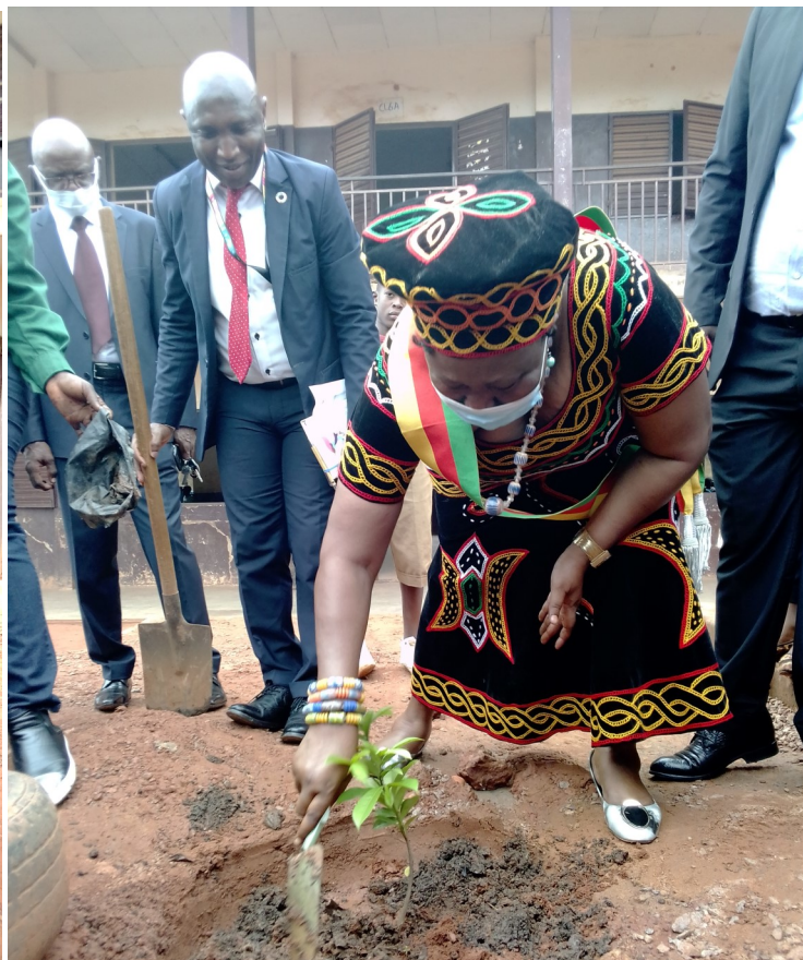
3 rd Deputy Assistant Mayor Yaoundé VI planting a tree to kick start the tree planting exercise